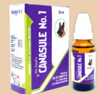
CANASULE No.1 As Immuno-modulator