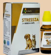
STRESSZA For Anxiety & Stress