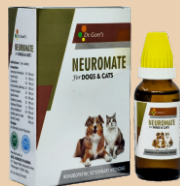
NEUROMATE For Epilepsy & Seizure