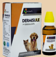
DERMISULE For Dermatitis