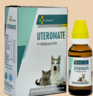
UTEROMATE For Uterine Problems