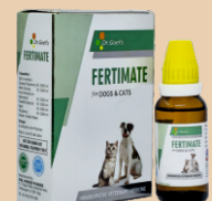
FERTIMATE For Pseudo-Pregnancy