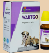
WARTGO For Warts