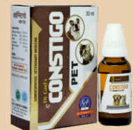
CONSTIGO For Constipation