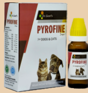
PYROFINE Pyrexia & Fever