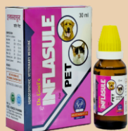
INFLASULE For Inflammation of Joints