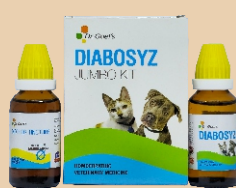
DIABOSYZ For Diabetes