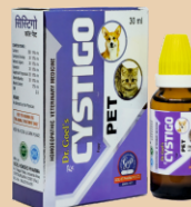
CYSTIGO For UTI & Cystitis