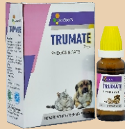
TRUMATE Trauma & Injury