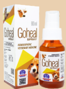
GOHEAL SPRAY For Wounds