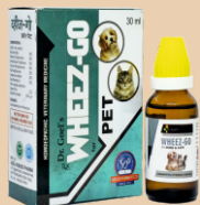
WHEEZ-GO For Kennel Cough