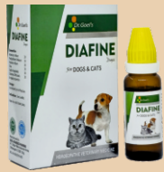
DIAFINE Diarrhoea & PARVO