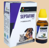
SEPTAFINE Septic in Body