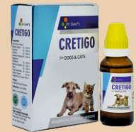
CRETIGO For Renal Impairment