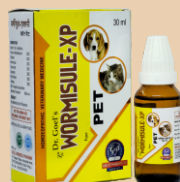
WORMISULE-XP For all type of worms