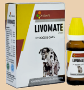
LIVOMATE Liver Disorders