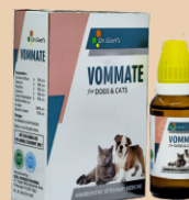
VOMMATE For Vomiting