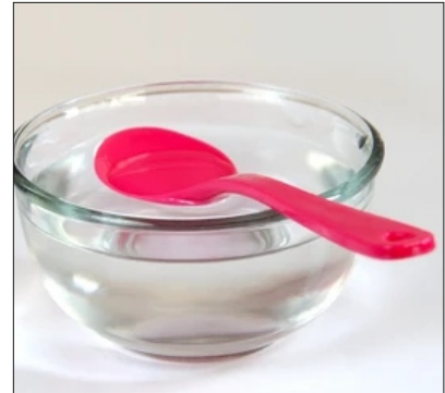
Stir well till it dissolves