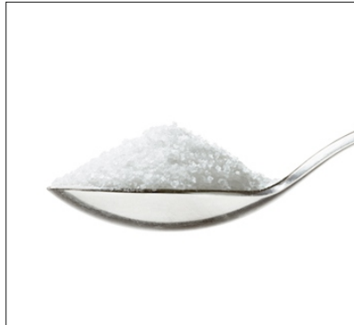
Take a spoonful Granules