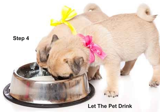
Let The Pet Drink