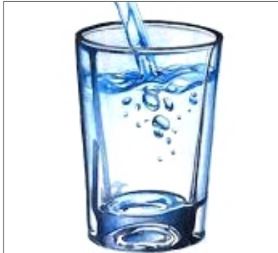
Take a glass of luke warm water